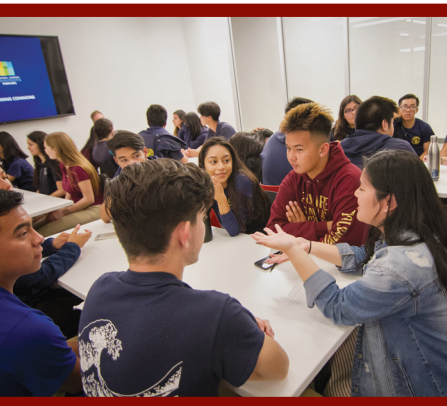
Preuss seniors visited UC San Diego's Teaching + Learning Commons

In June, more than 30 Preuss seniors who will attend UC San Diego in the fall had the chance to visit the Teaching + Learning Commons on campus. Here students can engage in peer-facilitated study groups; work with writing peer mentors, content tutors, and learning strategists; and discover resources for academic success.