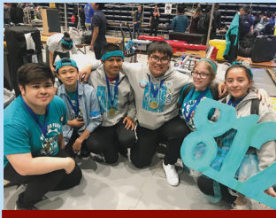
The Preuss School's FIRST Robotics Team #812